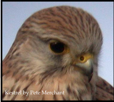
Kestrel by Pete Merchant

The remainder of the new trails are being constructed and visitors are flocking to find out just why this 'big wet flat field' is so vital to the wildlife and people of London and the South East.