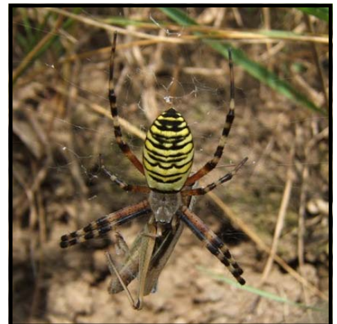
Wasp Spider and Small Red-eyed Damselfly