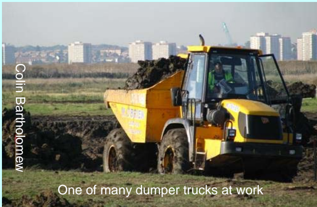
One of many dumper trucks at work