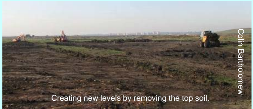
Creating new levels by removing the top soil.

Meanwhile the other important aspect of this project has begun; the new Shooting Butts Hide (see below). Work on the design of the foundations is underway with machinery digging deep holes into the marsh to find out what kind of soil lurks beneath. We even had an archaeologist watching the work to look