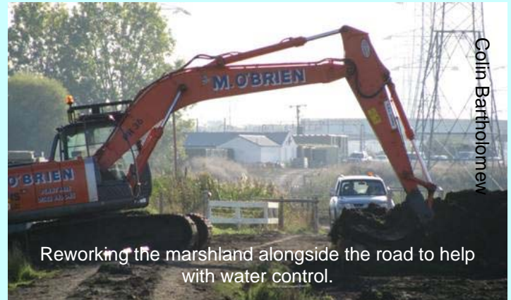
Reworking the marshland alongside the road to help with water control.