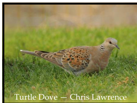
Turtle Dove

white bird it was astonishingly elusive! With both grey heron and little egret also present it was quite an achievement to have four species of heron on the reserve at the same time and is testimony to the hard work