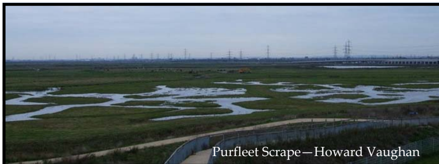
Purfleet Scrape—Howard Vaughan

Over the next 12-18 months we will build two new birdwatching hides with views over the enhanced wetland habitat; start work on another elevated viewing platform in the woodland area and new seating and artwork will appear in a range of locations.