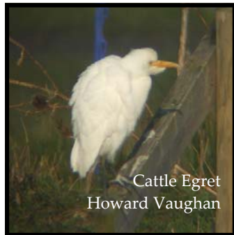
Cattle Egret Howard Vaughan

What's been about? Autumn really arrived in October with good numbers of wintering wildfowl coming in along with the visible passage of finches, buntings and larks. There were a few other treats to be found in the woodland including the Blyth's reed warbler (4 th -6 th ) that eluded all but the most patient and the two sparkling firecrests that joined a long-tailed tit flock. Three white-fronted geese