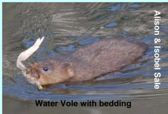
Water Vole with bedding

bar-tailed godwits started to move through and by the 30 th there were 45 on the foreshore.