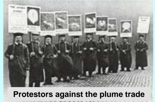
Protestors against the plume trade

The RSPB was founded in 1889 on the back of a long running campaign to counter the barbarous trade in plumes for women's hats, a fashion responsible for the destruction of many thousands of egrets, birds of paradise from New Guinea and other species across the world whose feathers had become fashionable in the late Victorian era.