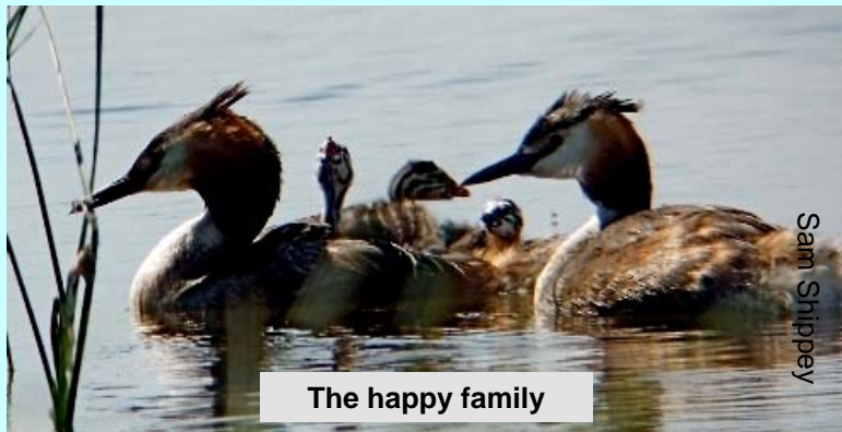
The happy family

Amongst those birds slaughtered senselessly were great crested grebes whose plumes adorned hats and whose fine belly feathers (known as grebe fur) were used as coat and hat trim.