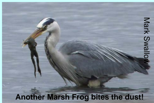
Another Marsh Frog bites the dust!

All these waders would have been on their way north to the Arctic to breed and this passage was mirrored across the country over the course of the week. On the river various terns were moving and 16 black , 11 Arctic , 12 common and two little terns were logged. Two Sandwich terns were seen over the next four days and a curlew sandpiper on 14th - 15th and 31st added spice. Other waders included four avocet (14th) and 16 British race black-tailed godwits (11th) that could well have been on their way to the Ouse Washes to breed.