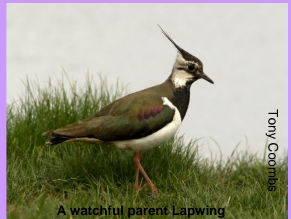
A watchful parent Lapwing

The warm spells in late May prompted a profusion of dragonflies and damselflies to emerge and even the wildlife garden pond had seven species on it! The garden is flourishing and is still attracting visitors (human and otherwise) of all shapes and sizes! Why not come and see for yourself?