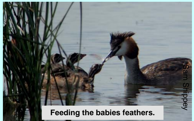
Feeding the babies feathers.

At the moment they can be seen with a little patience, hitching a lift with Mum and Dad. Enjoy!