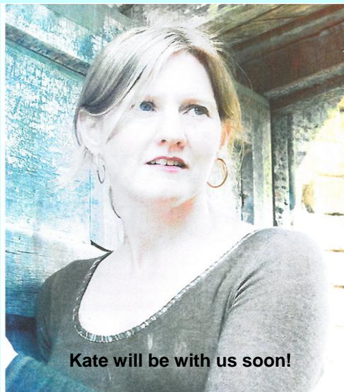
Kate will be with us soon!

With the summer holidays looming we have put together a great package of family focused events to keep everyone (including the adults!) occupied!