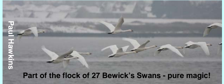
Part of the flock of 27 Bewick's Swans - pure magic!

on the 1st and 19th with 28 white-fronted geese north on 21st and a pink-footed goose going the same way on the 29th. A pale-bellied brent goose on 22nd was potentially a first for London of this form and a dark-bellied bird was seen on the 18th while three barnacle geese from the 19th coincided with a massive influx from the low countries into the south-east.