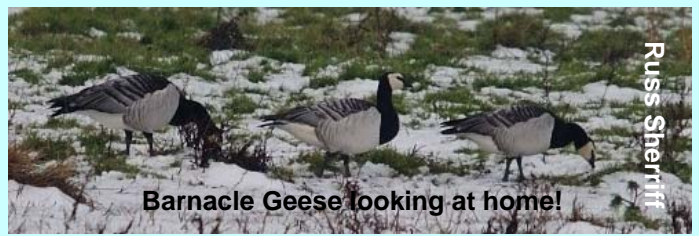
Barnacle Geese looking at home!

What's been about: December: It was a harsh month and the birds we found were representative of this weather with many species forced south by the snow and northerly wind. Three angular pomarine skuas got the month off to a good start with an plump eider the next day (till 4th) and another on the 29th. All three sawbill (fish-eating) ducks were seen including an amazing eight goosander and three smew (19th) along with a couple of red-breasted mergansers . Two goldeneye , common scoter and scaup added interest and two herds of Bewick's swans were seen with 27 on the 3rd and 19 on 22nd. They did not linger long and three adult whooper swans on the 24th did likewise. Fourteen Tundra bean geese were seen