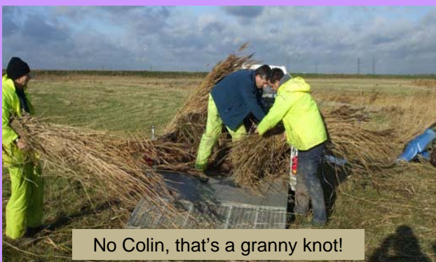
No Colin, that's a granny knot!

warm on a cold day! It is hoped that this will encourage lots of fresh growth in the spring and provide excellent breeding habitat for reed and sedge warblers and hopefully bearded tits.