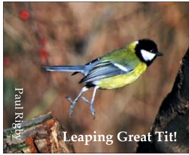
Leaping Great Tit!

The RSPB's Big Garden Bird Watch in late January was bigger and better than ever with hundreds of events nationwide. It is hoped that over half a million people will have taken part this year. It also gave us our busiest