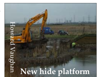
New hide platform

If you wish to join our e-news group to receive future Marsh Matters please email and let us know.