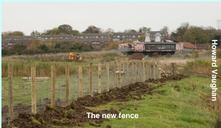
The new fence

Come rain or snow our contractors have been hard at work on the various projects out on the reserve. The predator-proof fence is almost complete with just the electric wire to go on the top to finish it off. It has even been buried into the ground to prevent anything from burrowing underneath! It already seems to blend in with the landscape and does not impede the view of the wildlife on the marshes.