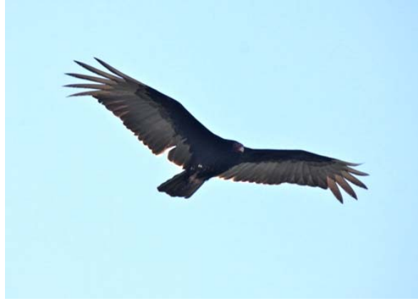
Cuban Black Hawk and Turkey Vulture

Other North American Warblers on their way south through the hotel grounds included American Redstart, Parula and Cape May while the Mango Swamp just beyond the hotel was home to Caribbean Greater Flamingos and Great Egrets. An American Kestrel showed well most days.