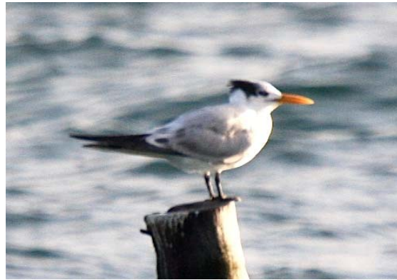
Double-crested Cormorant and Royal Tern