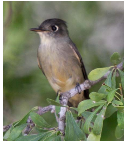
Greater Antillian Grackle and Pewee

A Cuban Black Hawk laded on the towel hut every afternoon and come to a nice big crab held up by one of the gardeners. Turkey Vultures were also encountered overhead.