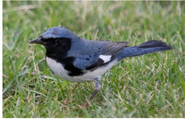
Green Heron and Black-throated Blue Warbler