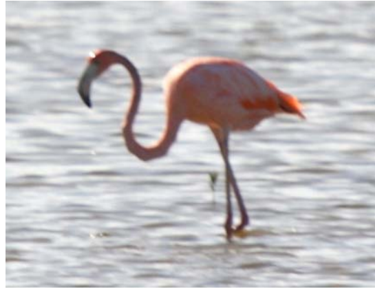
Great Egret and Caribbean Flamingo

Not bad at all as we rarely left the hotel grounds!