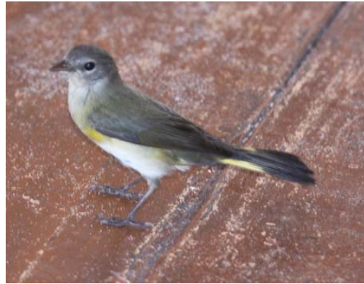
Palm Warbler and American Redstart