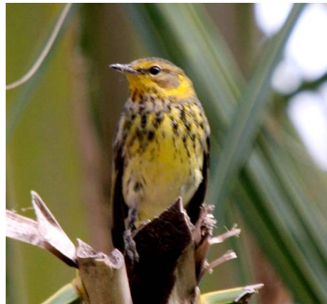
Northern Parula and Cape May Warbler