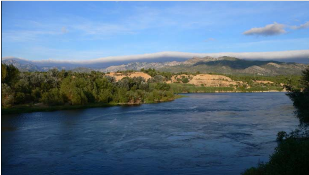
The Ebro & El's Port Mountains

Casa Siempre is situated on the east side of the village of Tivenys which is just northwest of Tortosa in the Taragona region, Spain. The property runs down to the banks of the river Ebro with the Ebro Delta not too far away. To the south you have the El's Port mountain range with more mountains to the north.