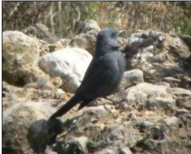
Blue Rock Thrush

There are a couple of 'Where to watch birds' guides, covering this area, the one I have is, "Where to watch birds in North & East Spain" by Michael Rebane. I've yet to birdwatch the Ebro Delta in a serious manner, something that I will have to put right.