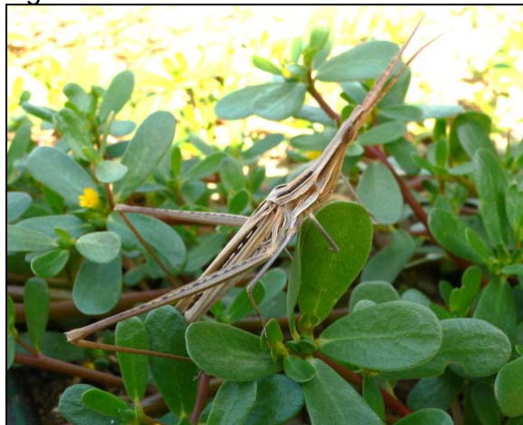
Funky Grasshopper species!